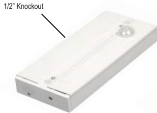
JBL-OCS-WH-277V (note: 277V have no switch)